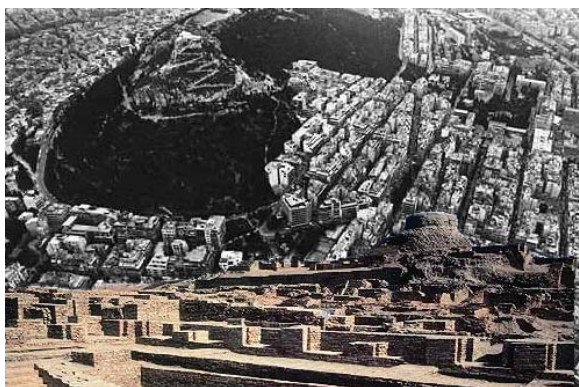
Aerial view of Central Athens & the Mohenjo-Daro Ruins

The ruins of the ancient city Mohenjo-Daro are found in the province of Sind, southern Pakistan. Dating to 2500 bc, the ruins are an important source of information about the Indus Valley civilization, which was one of the world's first great civilizations.